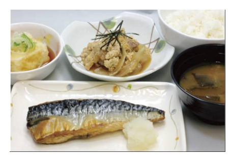
(A) Grilled Fish