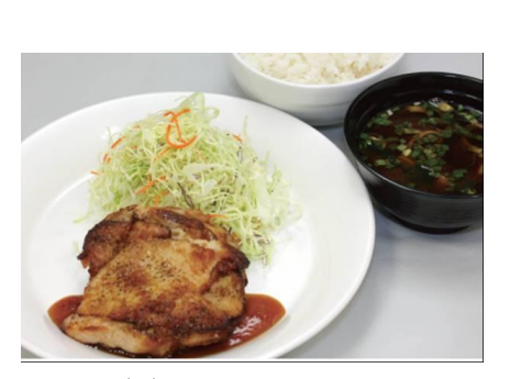
(D) Chicken Steak