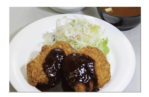
(B) Fired Pork in Nagoya Style