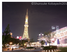
Nagoya TV Tower