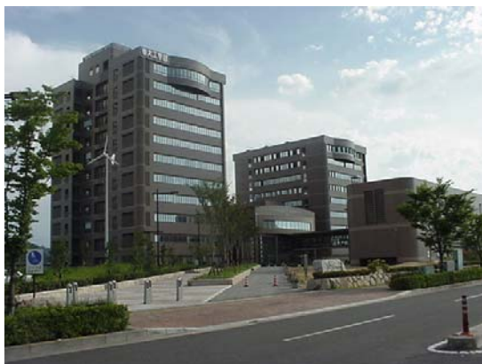
Campus of the Faculty of Engineering

2) Visit mechatronics laboratories in Faculty of Engineering, Kagawa University